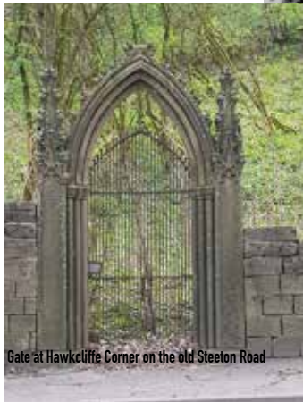
Gate at Hawkcliff Corner on the old Steeton Road